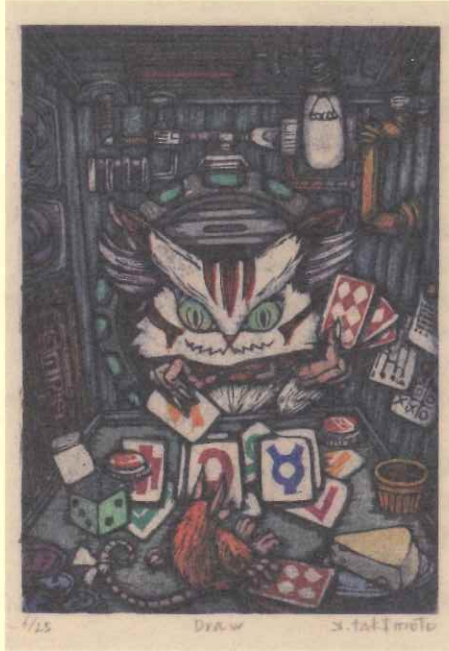
阿波和纸国际微型版画展2017年大奖「Draw」瀧本友里子(Yuriko Takimoto) JPN